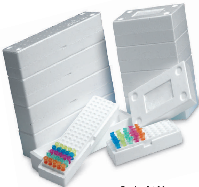
Pack of 100